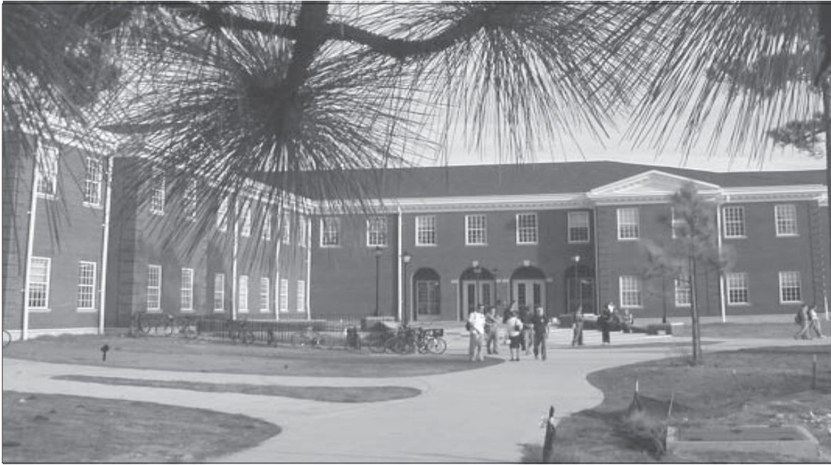
Lakeside Hall: New home of Foreign Languages & Literatures

Department of Foreign Languages and Literatures University of North Carolina at Wilmington 601 South College Road Wilmington, NC 28403-3297 Change Service Requested