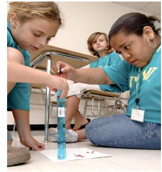
Students measuring blood splatter as a part of the crime scene investigation