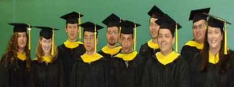
Spring 2006 Master's Graduates At the Departmental Ceremony