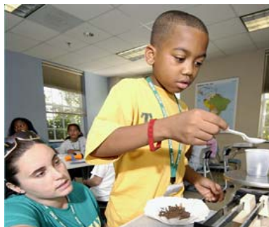
A student uses a balance to measure the mass of dirt.