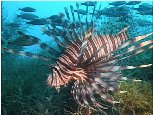
Lionfish on southeast Atlantic reef

The SEGM center's Florida Keys Research Program is a global leader in coral research, supporting over 5000 reef dives per year in the Florida Keys National Marine Sanctuary (FKNMS). The Aquarius undersea lab, situated 3 miles off Key Largo, is the world's only offshore "inner space" station, housing 6 aquanauts for weeks per mission, and sending real-time video and data to the Internet for research, education, and outreach projects.