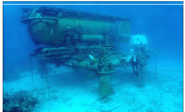
Aquarius undersea laboratory