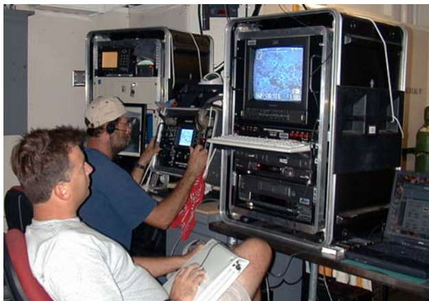
Pilot and scientist monitor ROV control consoles

The integrated navigation system displays the geographic and relative position of the support vessel and ROV on geo-referenced charts during operations using Hypack software. All video and digital stills are time-referenced to the navigation files so that the exact locations of images are known. Spare wires and payload capability are available for integration of other payloads provided by the science community.