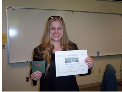
Crystal with gift card and letter of appreciation