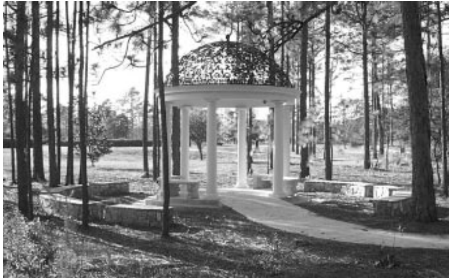
The Shinn Plaza.