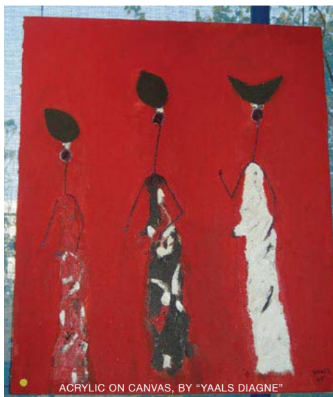
ACRYLIC ON CANVAS, BY "YAALS DIAGNE"