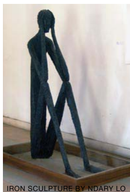
IRON SCULPTURE BY NDARY LO

These iron shackles still remain in a slave castle on the island of Gorée off the coast of Senegal. There are several structures still standing where slaves were held and exported across the Atlantic. Although the area known today as Ghana was a much more active slave exportation site, Gorée, the western most point in Africa, was also used by slavers.