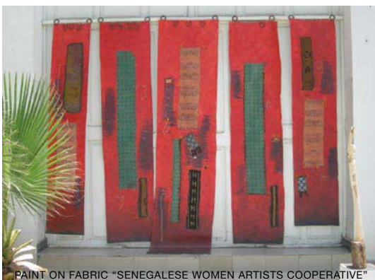
PAINT ON FABRIC "SENEGALESE WOMEN ARTISTS COOPERATIVE"