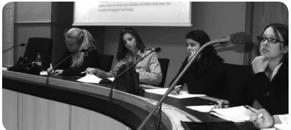
Inside District Court in Gothenburg, Sweden

unknown to us in the United States by sitting in while a witness bravely gave testimony, at no small risk to themselves, about how the acts of others had imperiled their family and way of life. We learned that no one side has a corner on the market of crimes against humanity. It was heartrending to learn how people had awakened every morning, as they had done for years, to tend to their herds, gardens, community and family, only to experience the loss of it all either at the hands of a government supposedly there to protect them, or at the hands of rebels supposedly fighting to overthrow the oppressive government.