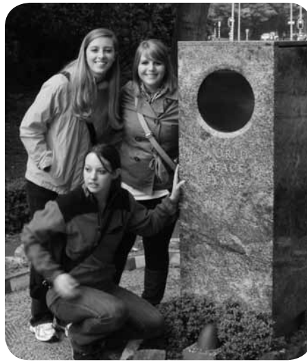
The World Peace Flame, a symbol of each nation's commitment to peace, lies outside the gates of the Peace Palace at The Hague.

There were so many phenomenal experiences. Each place left its own special imprint on us. The International Criminal Court at The Hague is a symbol of the hard work it takes to bring some order to the chaos of war. We got a peek at a life