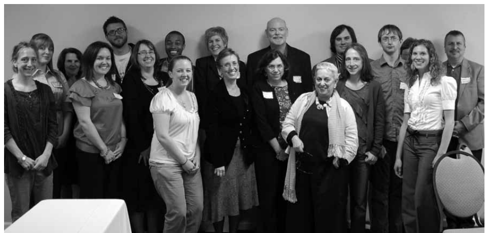
UNCW Sociology and Criminology faculty and students attend the NCSA at Wrightsville Beach