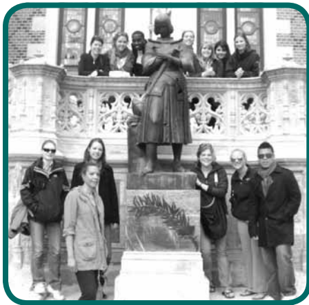
Statue of Joan of Arc in Orleans, France

On May 17, 2011, 12 members of the UNCW community—11 undergraduate students (International Criminal Justice) and one professor—embarked upon a 28-day study of international criminal justice systems. We focused on France, Sweden, and on the special courts at The Hague set up to bring to justice those accused of crimes against humanity, genocide or other war crimes. Along the way we met some wonderful people who helped us find our way when we got lost, helped us figure the U.S. dollar equivalent of Euros (€) or Swedish crowns (SEK) and gave us valuable insight into their way of life. We met lawyers, judges and police; visited palaces, courts and parliamentary bodies; read books and pamphlets; heard witness testimony in courts; and listened to highly informative lectures by noted scholars. We toured ancient jails, fortresses, old town halls and had the evolution of French policing very entertainingly explained to us in French. We walked more than our share of cobblestone streets; saw the Mona Lisa; walked through majestic gardens and heard fascinating stories about the history and traditions of the places we visited.